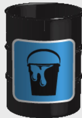
Paints, Inks & Adhesives