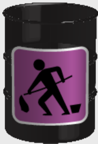
Sanitary & Janitorial