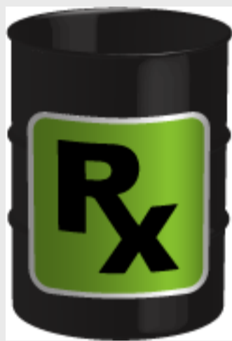
Medical & Pharmaceutical