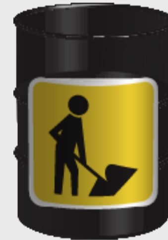
Building & Construction