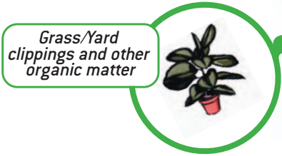
Grass/Yard clippings and other organic matter