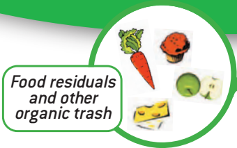
Food residuals and other organic trash